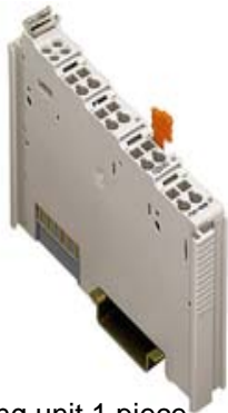
Packing unit 1 piece

Item no.: 750-600 Product description: END MODULE CAGE CLAMP®CONNECTION